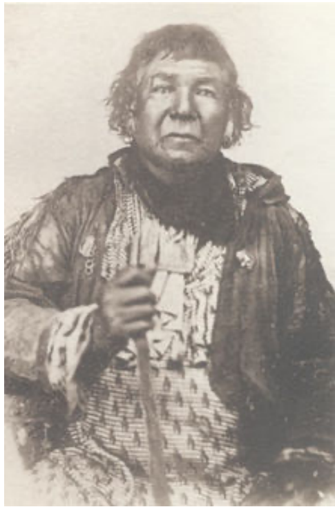
Figure 4: Chief Shabbona